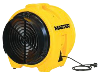
BL 8800 (40CM)