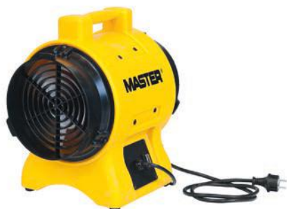
BL 4800 (20CM) BL 6800 (30CM)